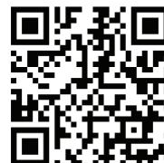
Marathon Motor Test